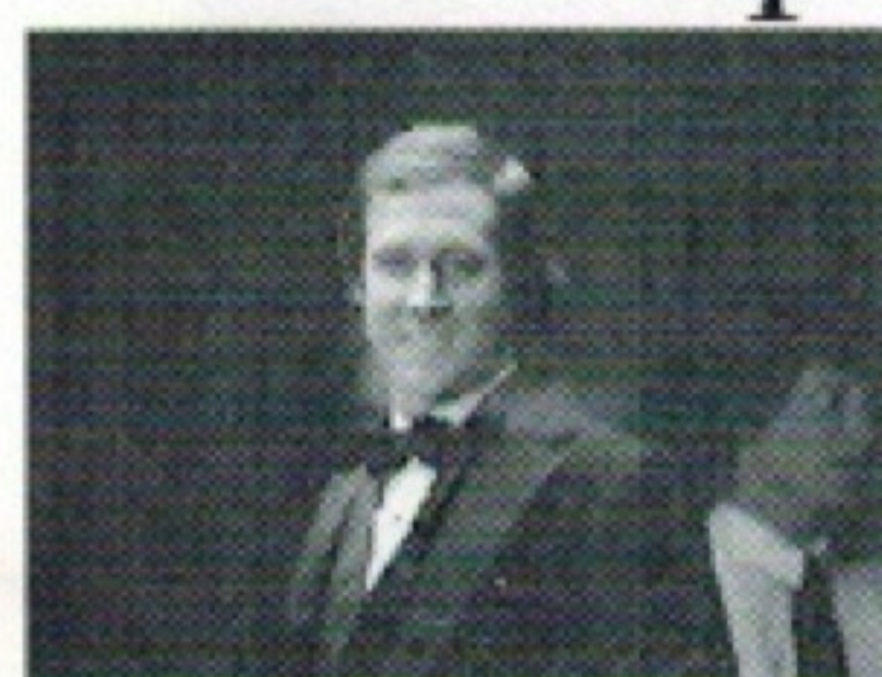
Chevy Chase, piano 8pm Mon., April 23

Chevy Chase, world famous actor and comedian, began life in the spotlight when he joined the Saturday Night Live crew in 1975. He made his first movie hit, Seems Like Old Times , in 1980, and went on to star in classic comedies Caddyshack , National Lampoon's Vacation , and Fletch . Many people don't know that Chase's other love besides acting and comedy is playing jazz piano. He has been MC at the Boys Harbor jazz concerts for the last two years, and also played some piano at those events. The Duke Jazz Ensemble looks forward to joining Chase for his first concert feature as a pianist.