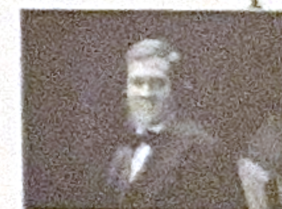
Chevy Chase, piano 8pm Mon., April 23

Chevy Chase, world famous actor and comedian, began life in the spotlight when he joined the Saturday Night Live crew in 1975. He made his first movie hit, Seems Like Old Times , in 1980, and went on to star in classic comedies Caddyshack , National Lampoon's Vacation , and Fletch . Many people don't know that Chase's other love besides acting and comedy is playing jazz piano. He has been MC at the Boys Harbor jazz concerts for the last two years, and also played some piano at those events. The Duke Jazz Ensemble looks forward to joining Chase for his first concert feature as a pianist.